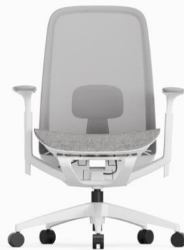
TM-F1D-W Grey Mesh, Cushion seat Dimensions: W 68 cm D 52.5-56.5 cm H 98.5-104 cm