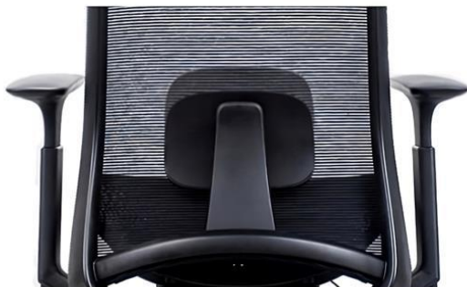
Height adjustable lumbar support