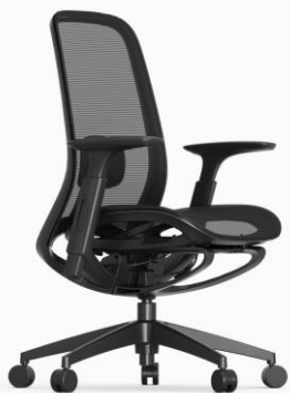
TM-M1D-B Black Mesh, AIR MESH seat Dimensions: W 68 cm D 52.5-56.5 cm H 98.5-104 cm