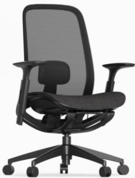
TM-F1D-B Black Mesh, Cushion seat Dimensions: W 68 cm D 52.5-56.5 cm H 98.5-104 cm