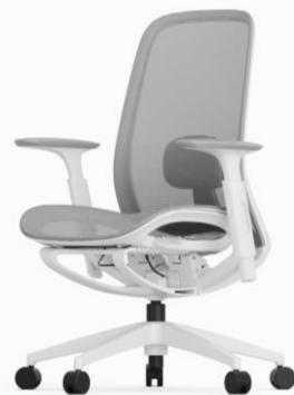
TM-M1D-W Grey Mesh, AIR MESH seat Dimensions: W 68 cm D 52.5-56.5 cm H 98.5-104 cm