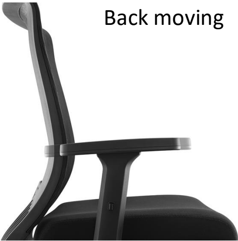
Pad Front & Back moving