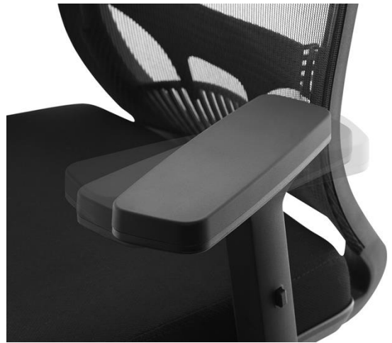
Pivotable Arm Pads